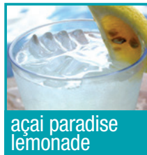
açai paradise lemonade