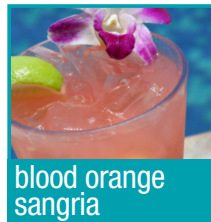
blood orange sangria